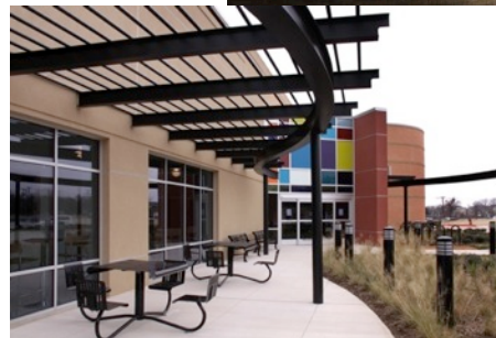
Public/ Private Venture